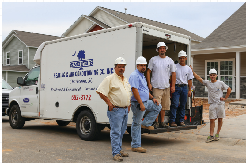
(above) During construction, the employees of Smith's Heating and Air Conditioning work to install and test the exterior unit and the interior duct work in the attic.